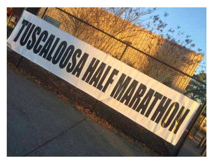
What will you see along the Tuscaloosa Half course? This is the third year of this race and the third course, so either they are perfecting it each year or trying to keep all you runners on your toes. Not literally, because you all know midfoot is best, right?

The course had some spectators but not many. After all, Tuscaloosa is a college town, and the race was awfully early for college students. We did see at least one group of rowdy college kids (I question whether they'd even been to sleep since the night before), but I expected more from T-town — with that many students, they should all be out there causing a scene (i.e. making it fun) at this race.