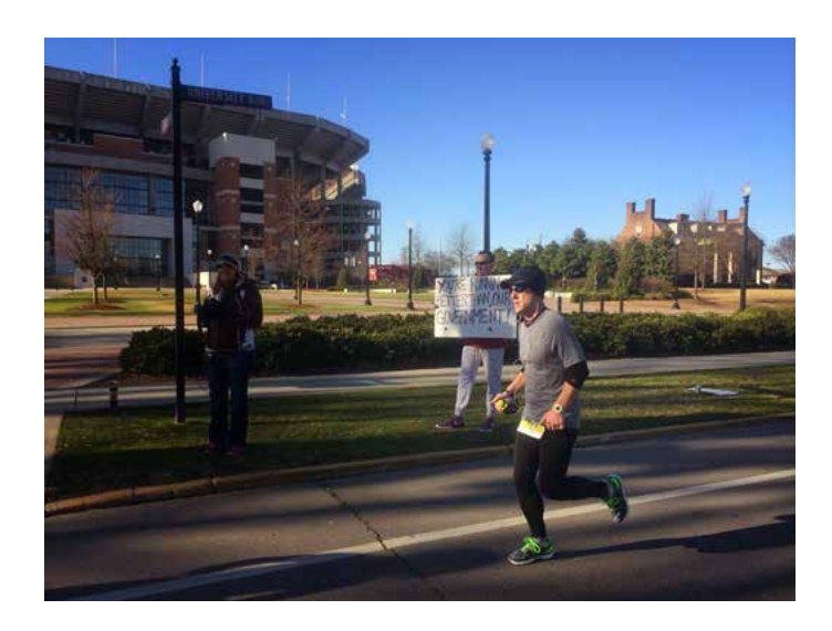
We ran behind and in front of the football stadium, for you Roll Tiders out there.

The course had some spectators but not many. After all, Tuscaloosa is a college town, and the race was awfully early for college students. We did see at least one group of rowdy college kids (I question whether they'd even been to sleep since the night before), but I expected more from T-town — with that many students, they should all be out there causing a scene (i.e. making it fun) at this race.