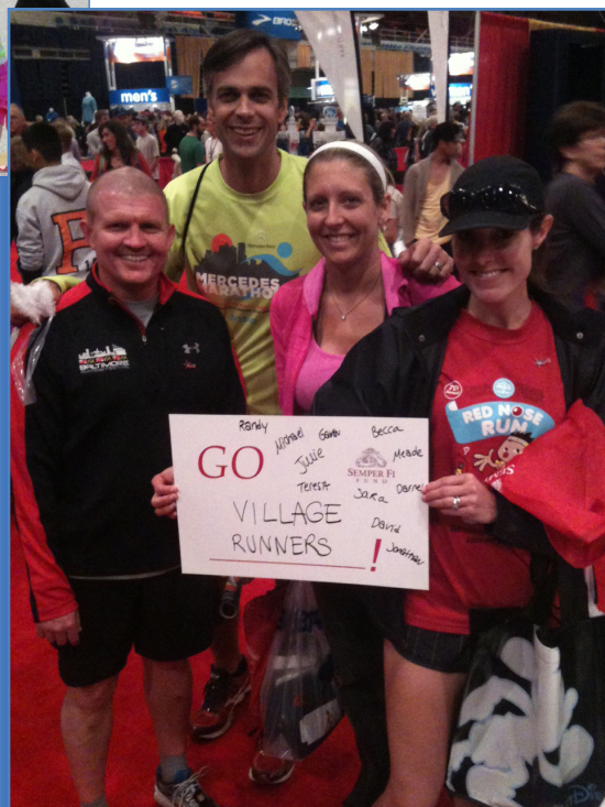
Figure 5 - At the expo of the Marine Corps Marathon