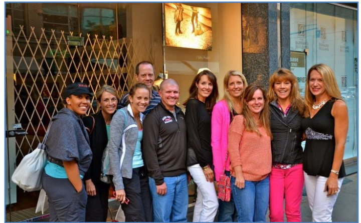
Figure 2 - Some of The Village Runners after dinner in Vancouver the night before SeaWheeze Half Marathon Vancouver or Huntsville, with close friends.

Although many of us are often training for different races, we always support one another and are willing to show up early or add to the route if someone needs extra miles. On a number of occasions, we have traveled to races as a group. There's nothing better than being at the start line of a marathon or half marathon in another city, whether