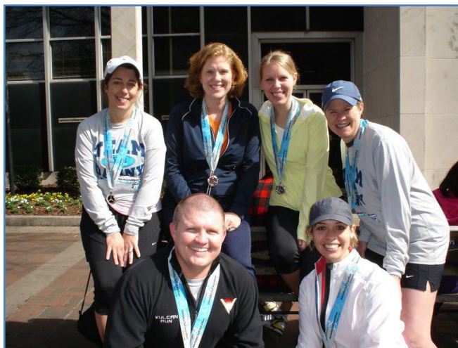
Figure 1 - The original Village Runners after the 2009 Mercedes Half Marathon

you run with the same people as often as we do, you get to know one another very well. We may have started out as a group of fellow runners helping one another stay consistent with our training. We have become close friends. We share so much more than a few miles of road together. By nature, I am a very private person but I found that I feel no reservation