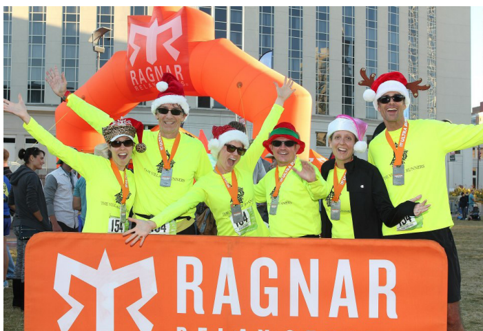
Figure 4 - Some Village Runner shortly after they finished Ragnar Relay Tennessee running as an ultra-team

"Running with a group has turned me into a co-dependent runner – while I relish an occasional solo run, it's my running group that gets me out of bed every day to pound out the miles. It is knowing that someone is waiting for me at the track or at the Western when it's time for speed work or a tempo run. And, most certainly, it's my running group that motivates me to show up for the occasional 4:30 a.m. 'beast mode' run to beat the heat of triple digit summer days.