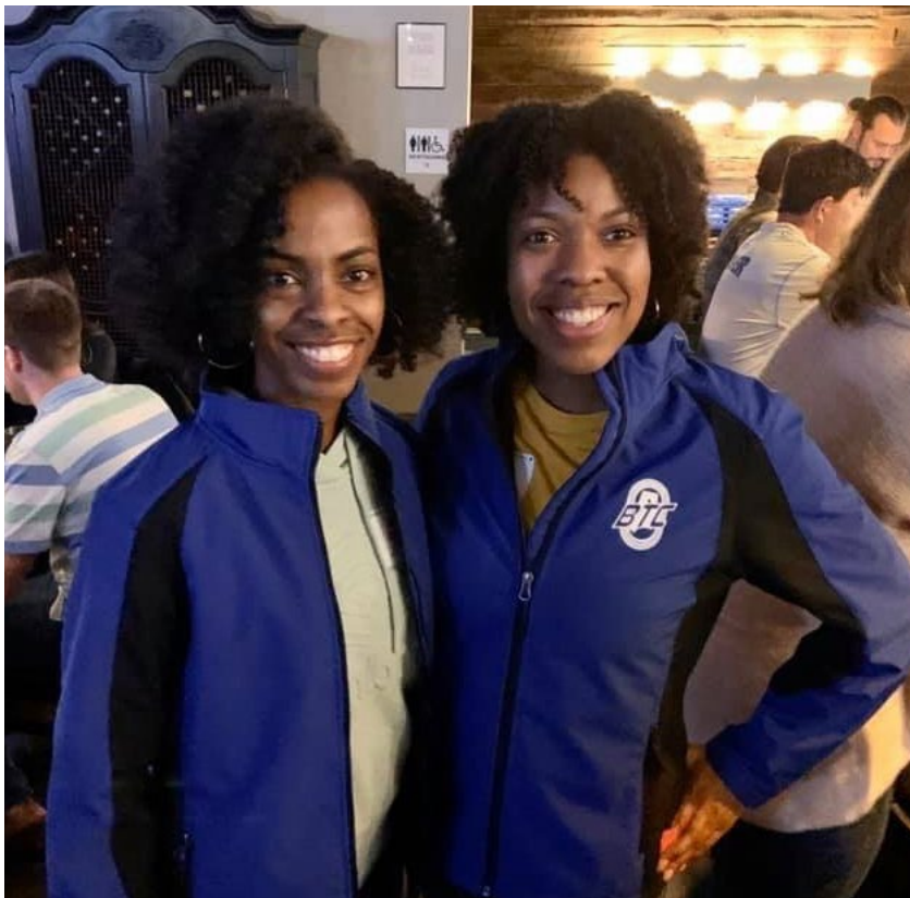
Celebrating 1200+ miles