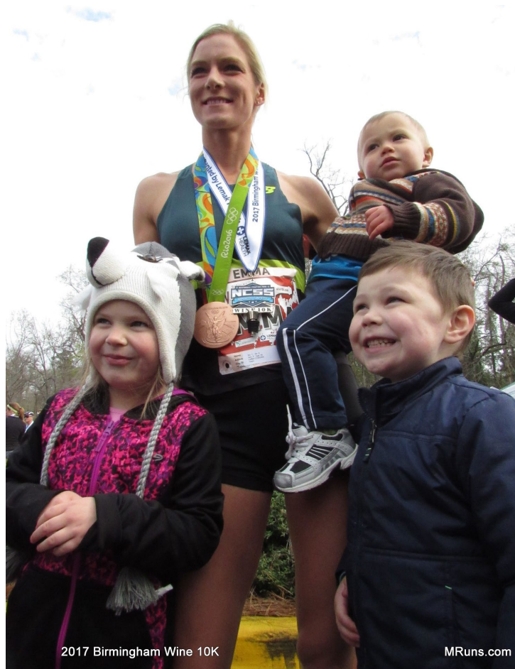
2017 Birmingham Wine 10K

About two hours after the festivities are over and you've just hung up your finisher medal or your awards, we want runners to say, "I can't wait until next year!" When we started this race, our goals were to produce a well-executed race that was fast and fun and provided a unique runner experience. I feel like if we can do this, people will continue putting Birmingham Wine 10K on their race schedules.