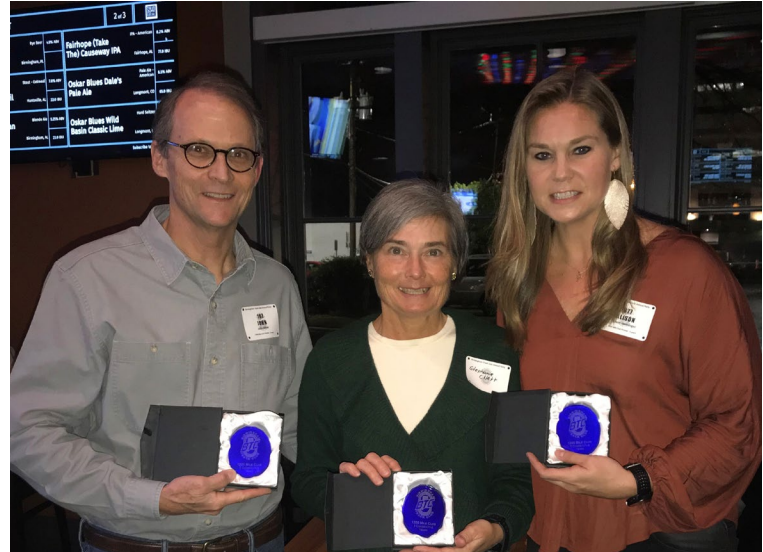
1200 Mile Club Five Year Award Winners