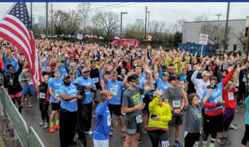
2016 Rumpshaker Start Line