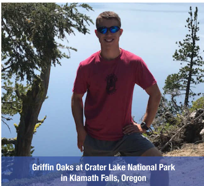
Griffin Oaks at Crater Lake National Park in Klamath Falls, Oregon