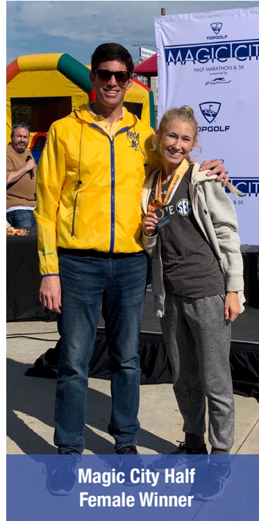
Magic City Half Female Winner

It has been a fantastic year for the RRCA Alabama Championship races, and we have already begun lining up the schedule for 2019. When you see an RRCA Championship designation on an event, you can rest assured that it is a well-run, quality event, hosted by a professional staff. Make sure to come out and support the next one you see!