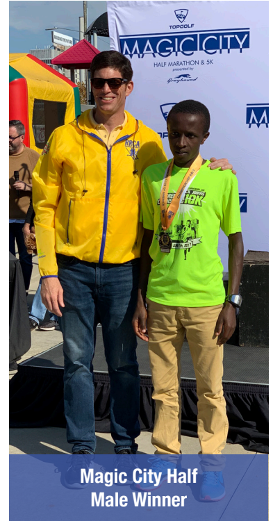
Magic City Half Male Winner