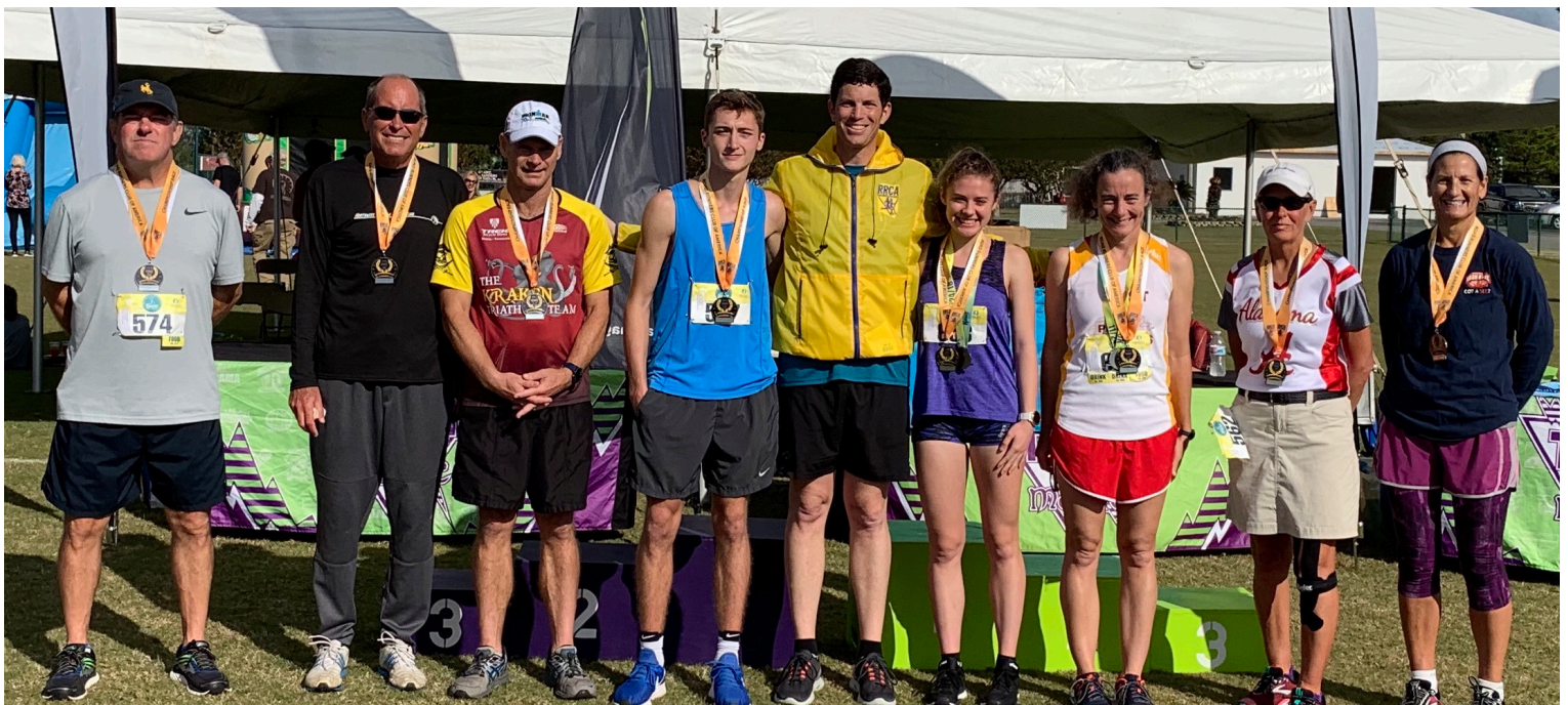
Coastal 5k State Champions