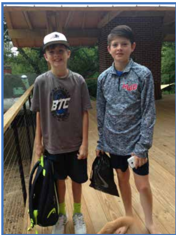
The Andress Boys