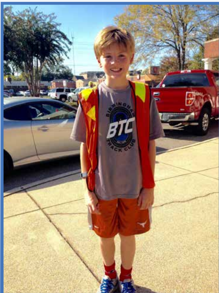
BTC gear is so awesome, even safety patrol members wear it!